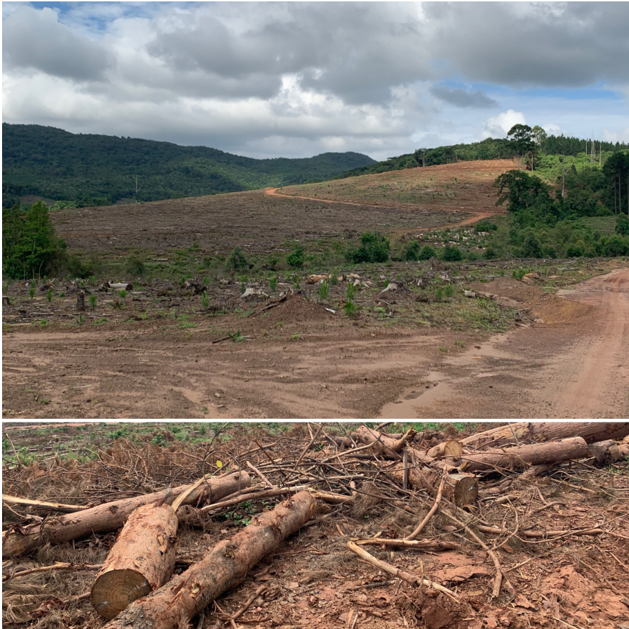
FIGURE 2 Pine plantations

Thus, dehumanization and exploitation characterize these geospatial points of extraction that are created through epistemic violence and material severing that seek to destroy epistemic territories.