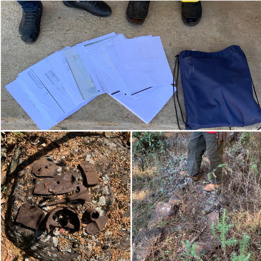
FIGURE 4 Land Restitution

instance, a young focus group member expressed her desire for these teachings: “What I would like to see happening to us the youth is that elders must guide us and tell us if we are wrong, and also show us our customs, they must tell us if you do this there will be consequences. Because now we are living in a modern way, we are no longer living like before.”