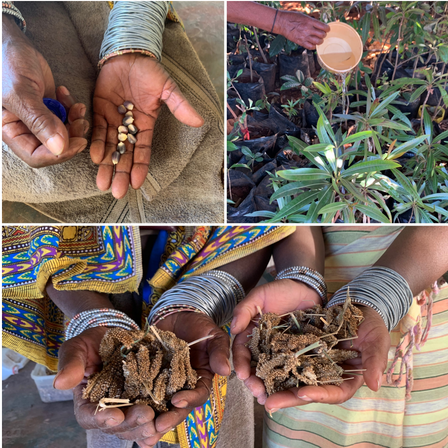
FIGURE 5 Reforestation and food sovereignty

also shown how coloniality is part of the relations in places where mining, logging, and other forms of capitalist extraction take hold in Latin America/Abya Yala. What is important in these territories is that modernity conceals coloniality, which sanctions domination, conflict, and epistemic violence (Gómez-Barris, 2017; Mignolo, 2016; Mignolo & Walsh, 2018). Thus, coloniality is the dark underbelly of modernity that drives extractive economies, governance systems, political and social orders that take structural form within society and create and dictate unjust social relations of class, race, and estate (Quijano, 2007). The current paper also demonstrates that these histories impress upon people's lives contributing to profound community-level psychological distress. Critical psychology should be concerned with these psychological experiences that are taking place all around the world.